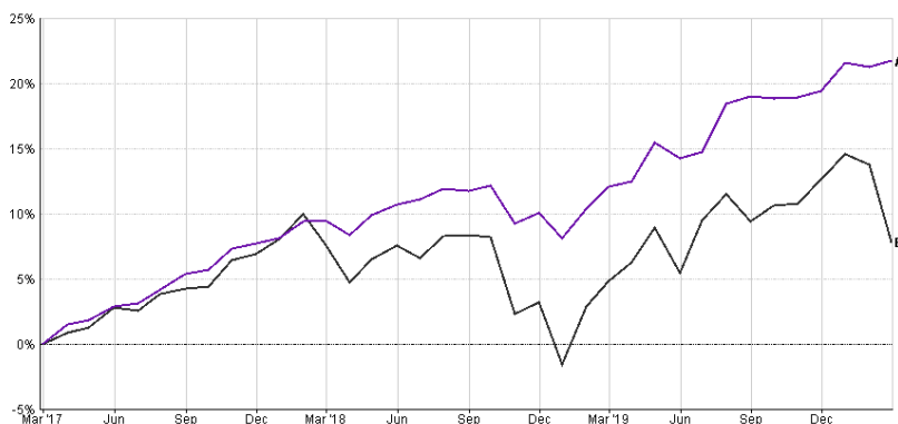
■ A - MyOptimum Adventurous TR in GB [21.78%] ■ B - FO Mixed Asset - Aggressive TR [7.86%]

28/02/2017 - 28/02/2020 Data from FE fundinfo 2020